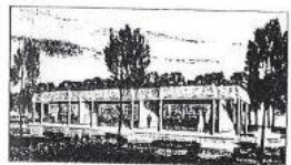
Predeveloped Site For Sub-Properties Available With Discounts.