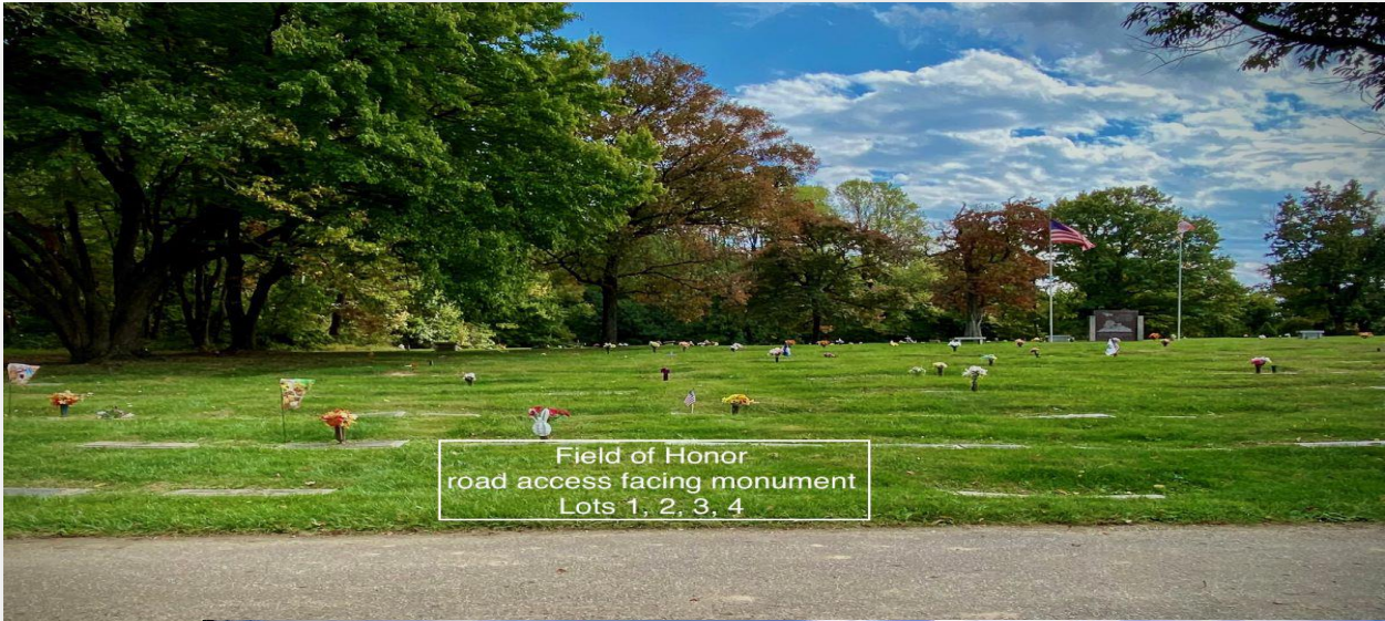
Field of Honor road access facing monument Lots 1, 2, 3, 4