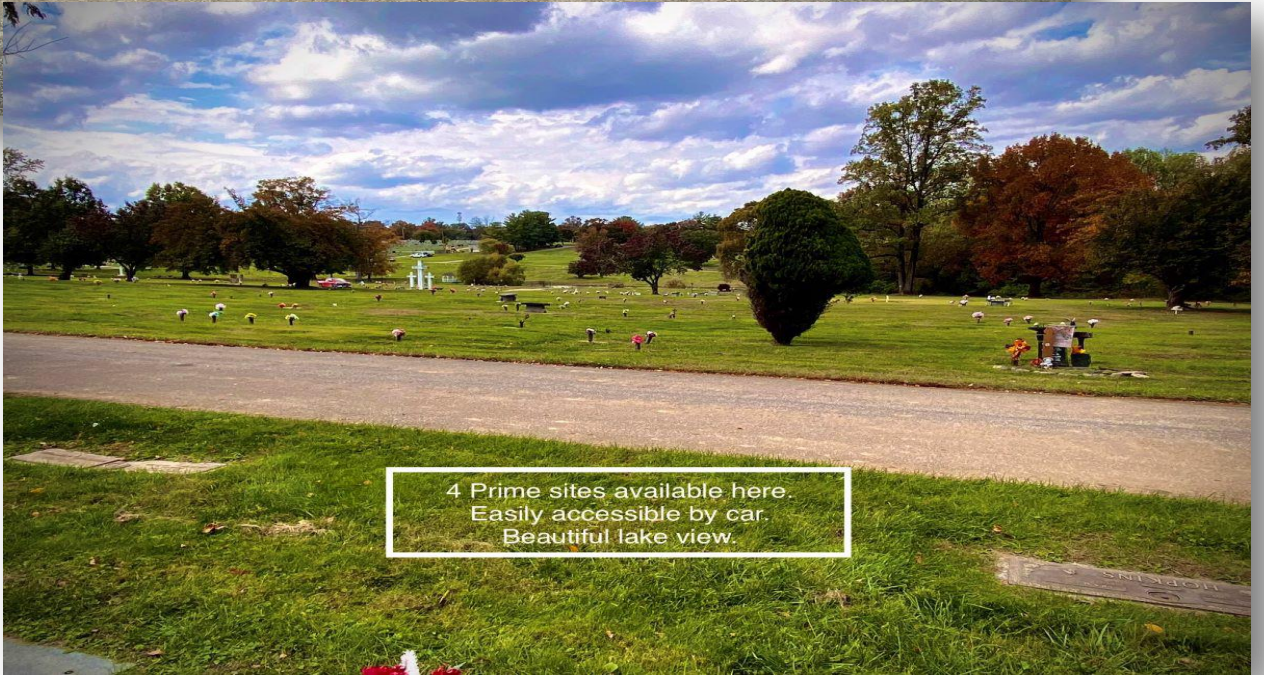
4 Prime sites available here. Easily accessible by car. Beautiful lake view.